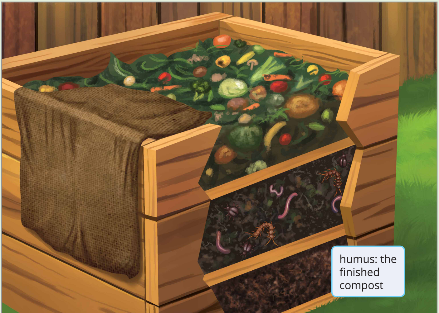
humus: the finished compost