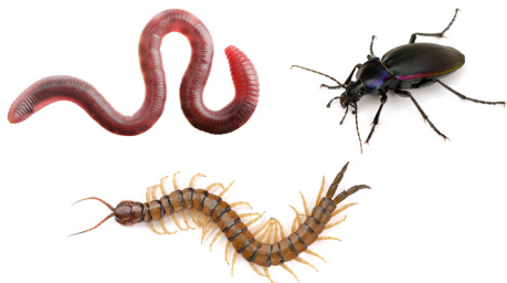
worms and insects