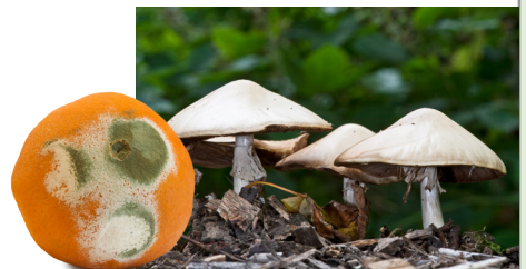
fungi and mould

Worms and insects: The compost bin provides a safe habitat for these creatures, and plenty of food. As well as eating the scraps, they feed on the fungi and bacteria in the bin. Bacteria: These are Earth's smallest living things. They are good at breaking down the food scraps. You can help them grow and multiply by mixing up the compost regularly. Fungi and mould: These sound yucky, but they are important for a healthy compost bin. When you see green or white stuff on a piece of fruit, that's mould hard at work breaking it down.